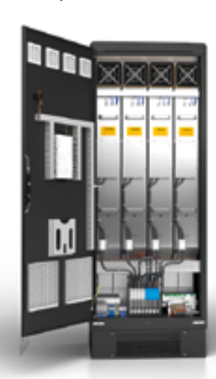
TESVOLT PCS with four inverter modules (IPUs)

Not all functions are available in all countries. For further information, please contact your area manager. Please also observe our compatibility list in the downloads section of our homepage.