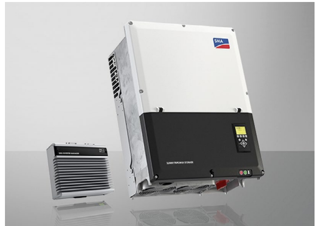
SMA Sunny Tripower Storage 60 with SMA Inverter Manager